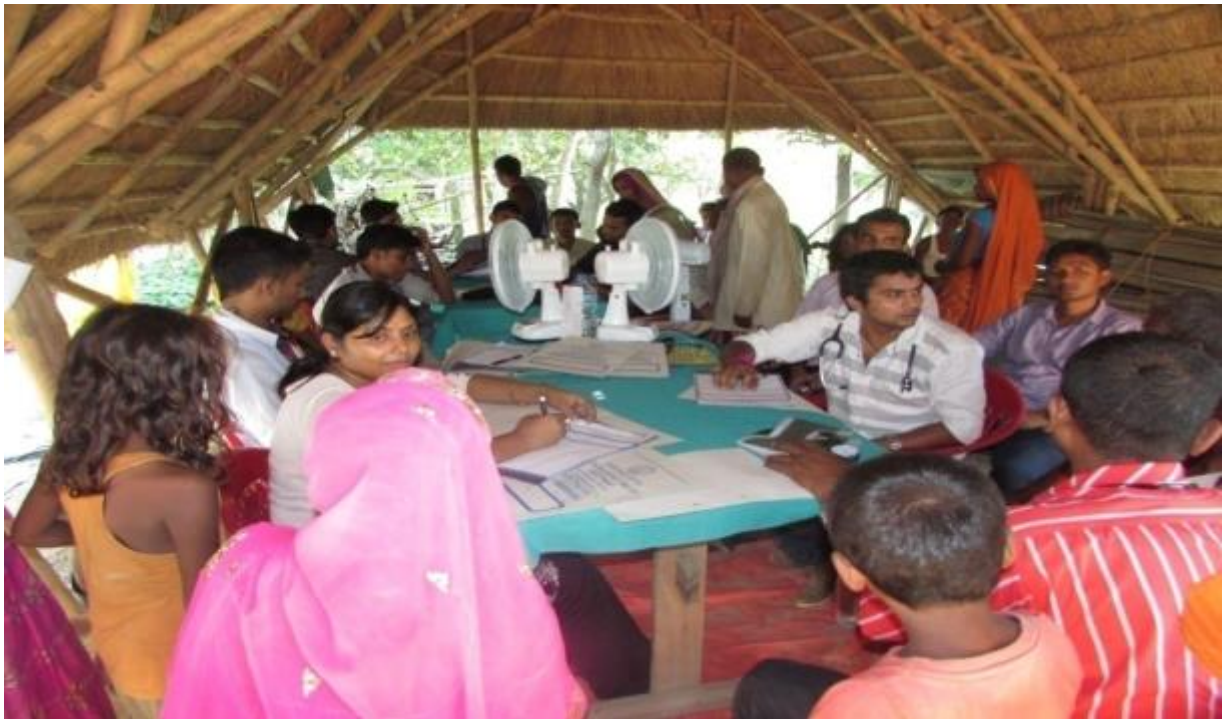
Health Check-up by Doctors