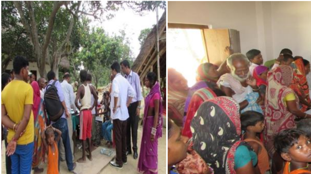
Rush of Patients