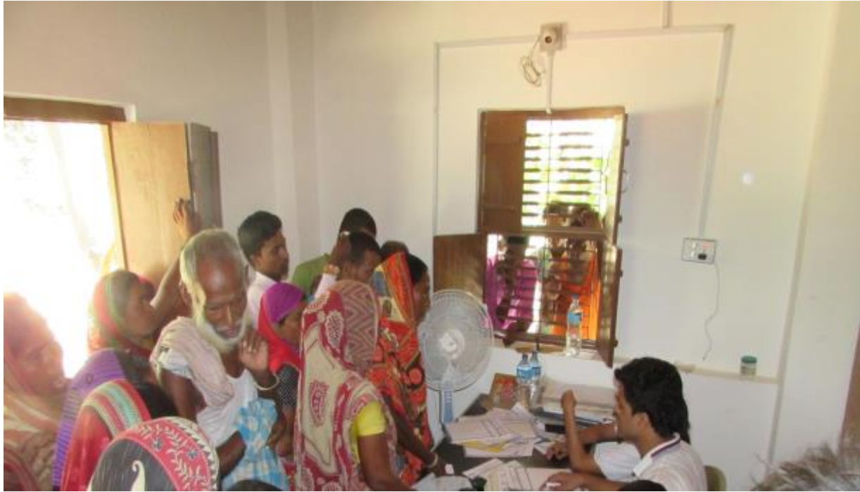
Registration of the patients