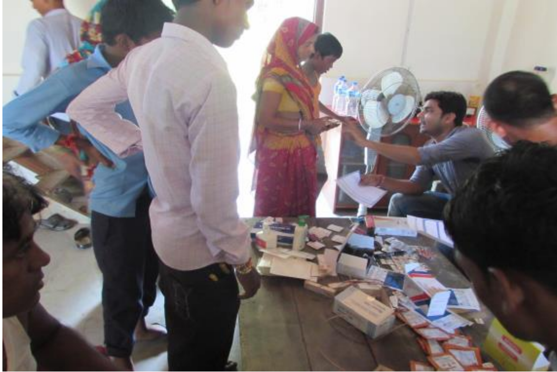
Dispensing of Free Medicines