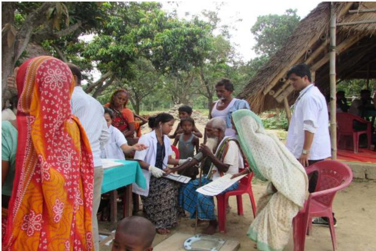
Measurement of B.P done by the Medical Staff