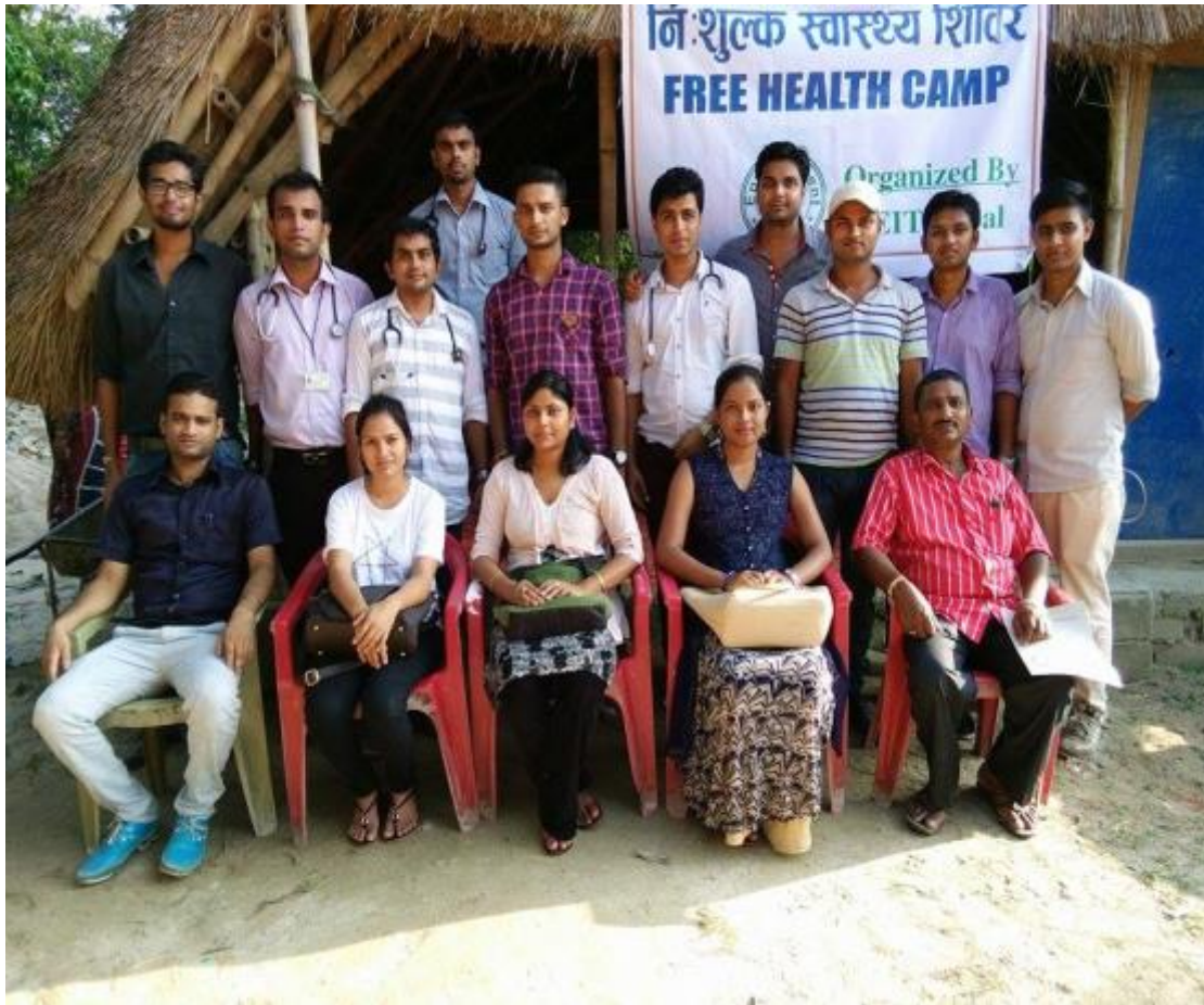
Team member of camp

Organizer of Health Camp SEIT Nepal Baghchauda-9, Belhi, Dhanusha, Nepal