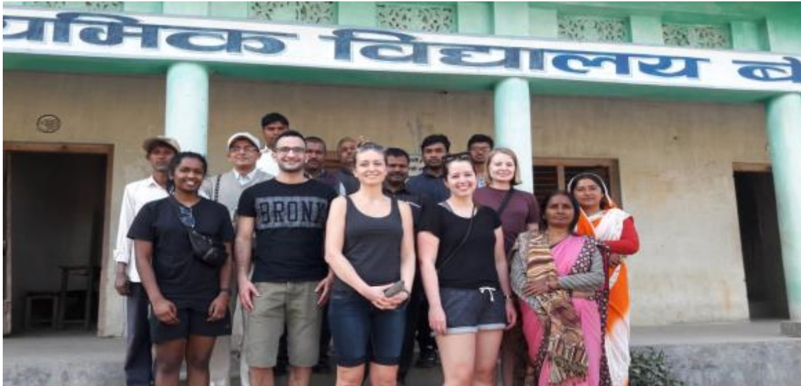
Dental team member visited at School

supported the awareness activities. All the health education material was displayed sequentially as to give health education proportionately.