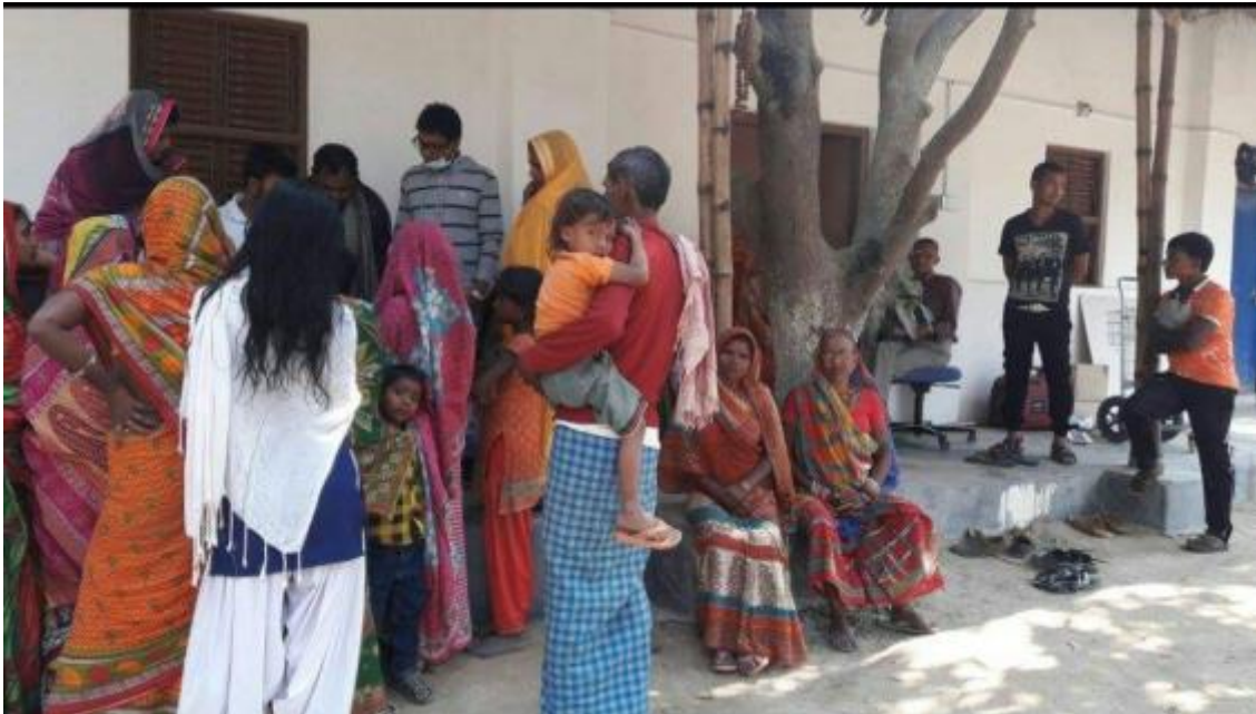
Rush of patients for registration