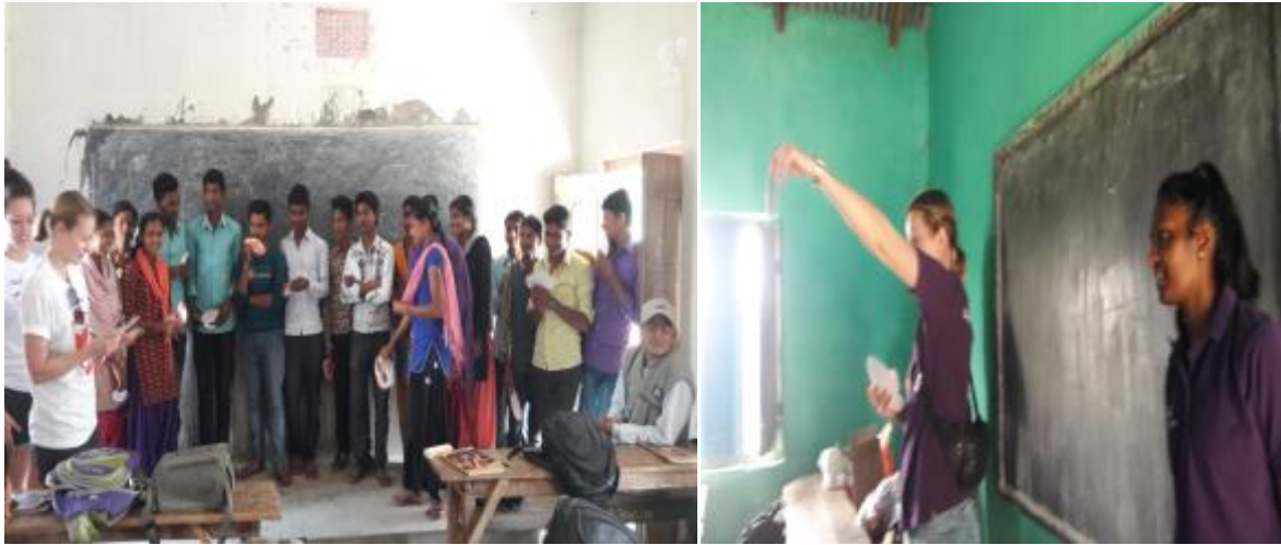
Showing posters of foods and asking which are good and bad for dental health

of sugar one must read the food labels and choose the right food and beverages that are low in added sugar”, the dental hygienists added.