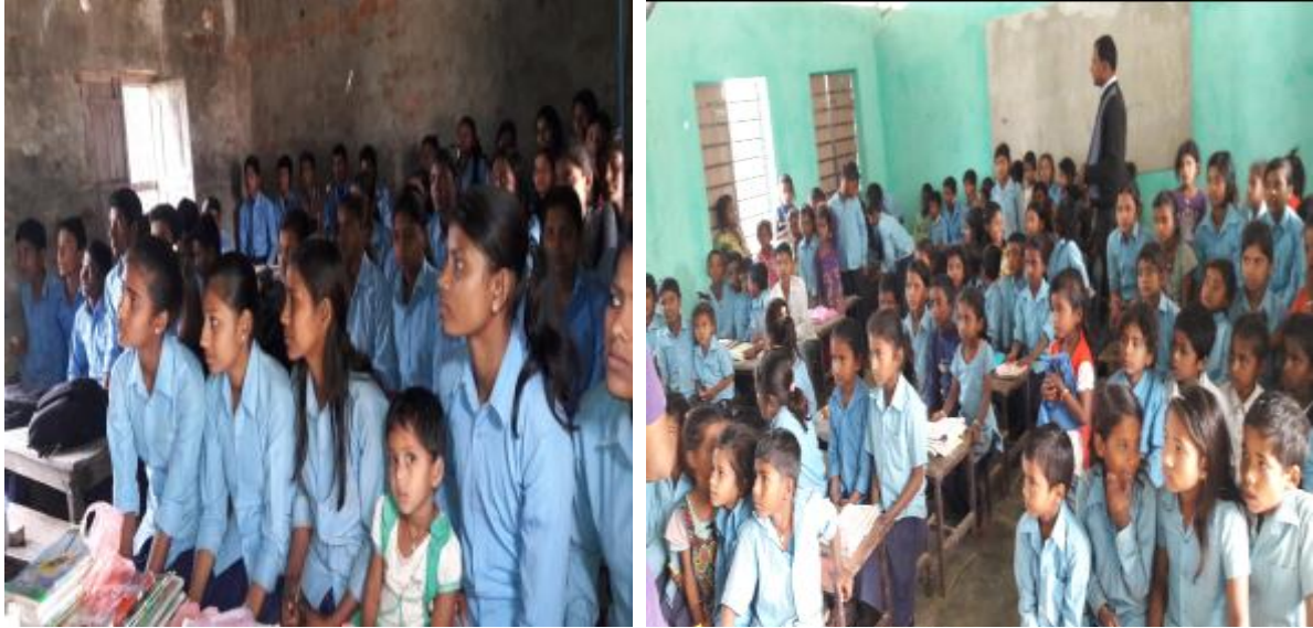
School children in a class

We were unable to attend all of the school children because many of them were absent due to marriage seasoning and some of them were drop out from school. We have attended only those students who were present that day in school and the remaining students who were absent that day will be attended in next dental awareness camp. We felt that the parents of small children needs to taught about dental care so that they can guide their children in home while brushing.