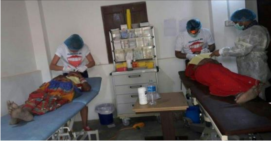
Treatment Provided by Dental doctor