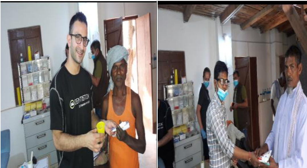
Dispensing of Dental Health Pack

Patients were also given dental health related information like danger of smoking, Tobacco chewing and betel chewing and instruction on tooth brushing and maintaining their oral health. Various medicines and dental health pack were provided.