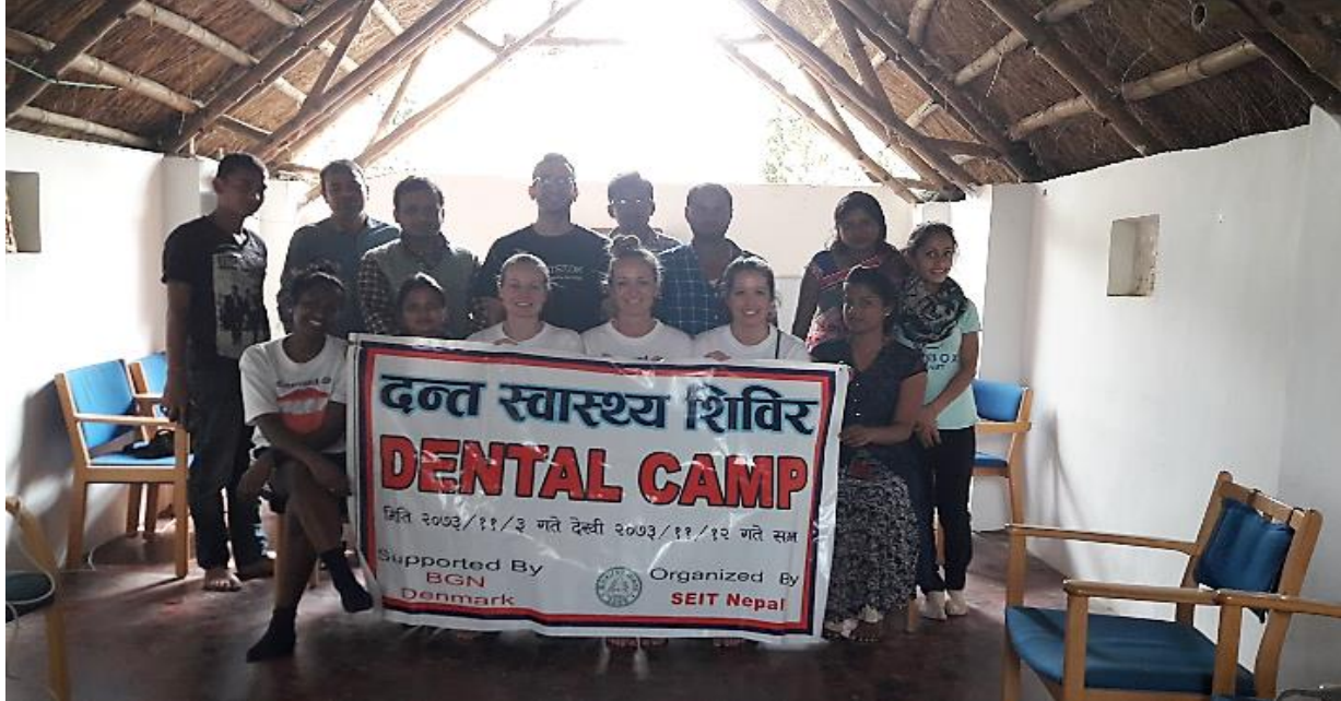
Team member of camp