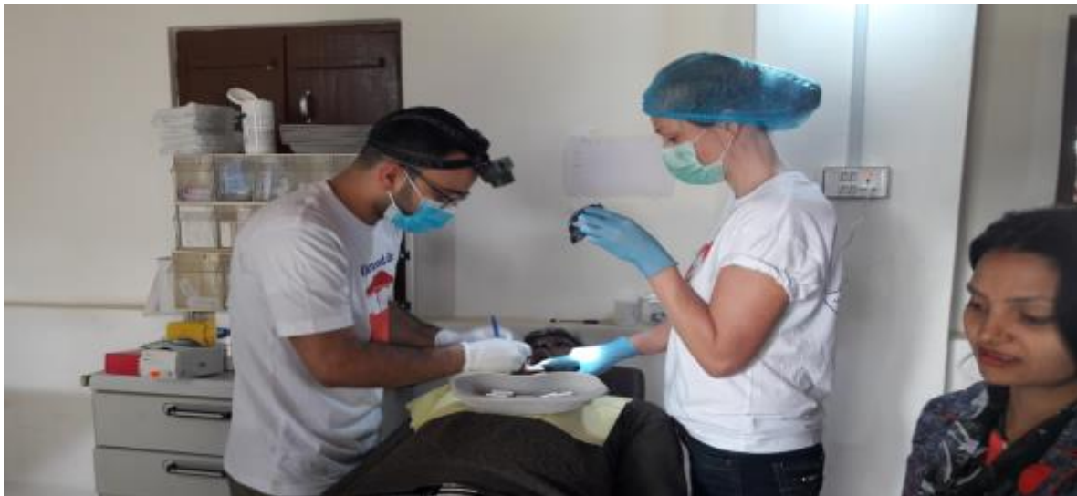
Dental check-up done by doctor

During Seven day of outreach program 255 patients were examined, and those in need, treated.