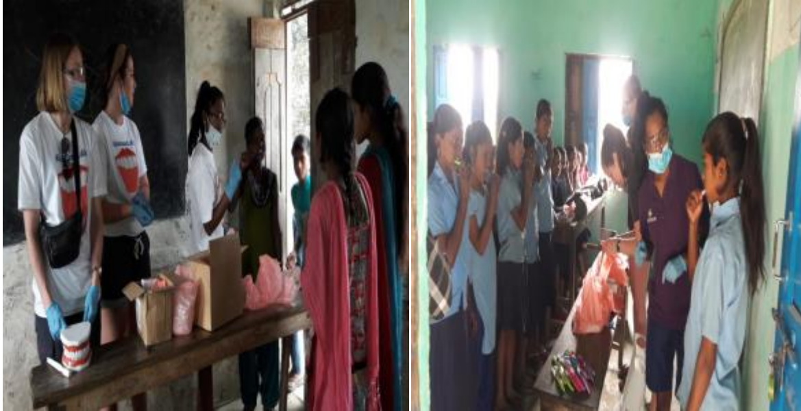
Return demonstration of brushing technique seen by dental hygienists