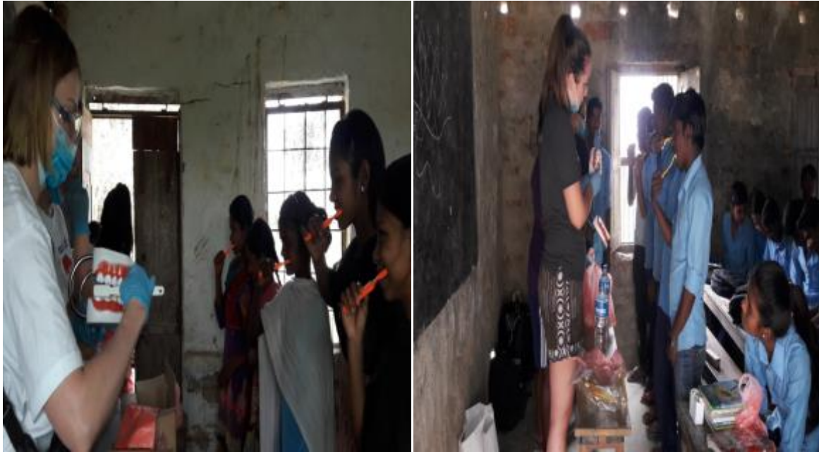
Showing demonstration of brushing technique

In third session, the demonstration of brushing technique is shown by dental hygienists to school children and return demonstration of brushing technique from each and every school children is seen and guided by dental hygienists.