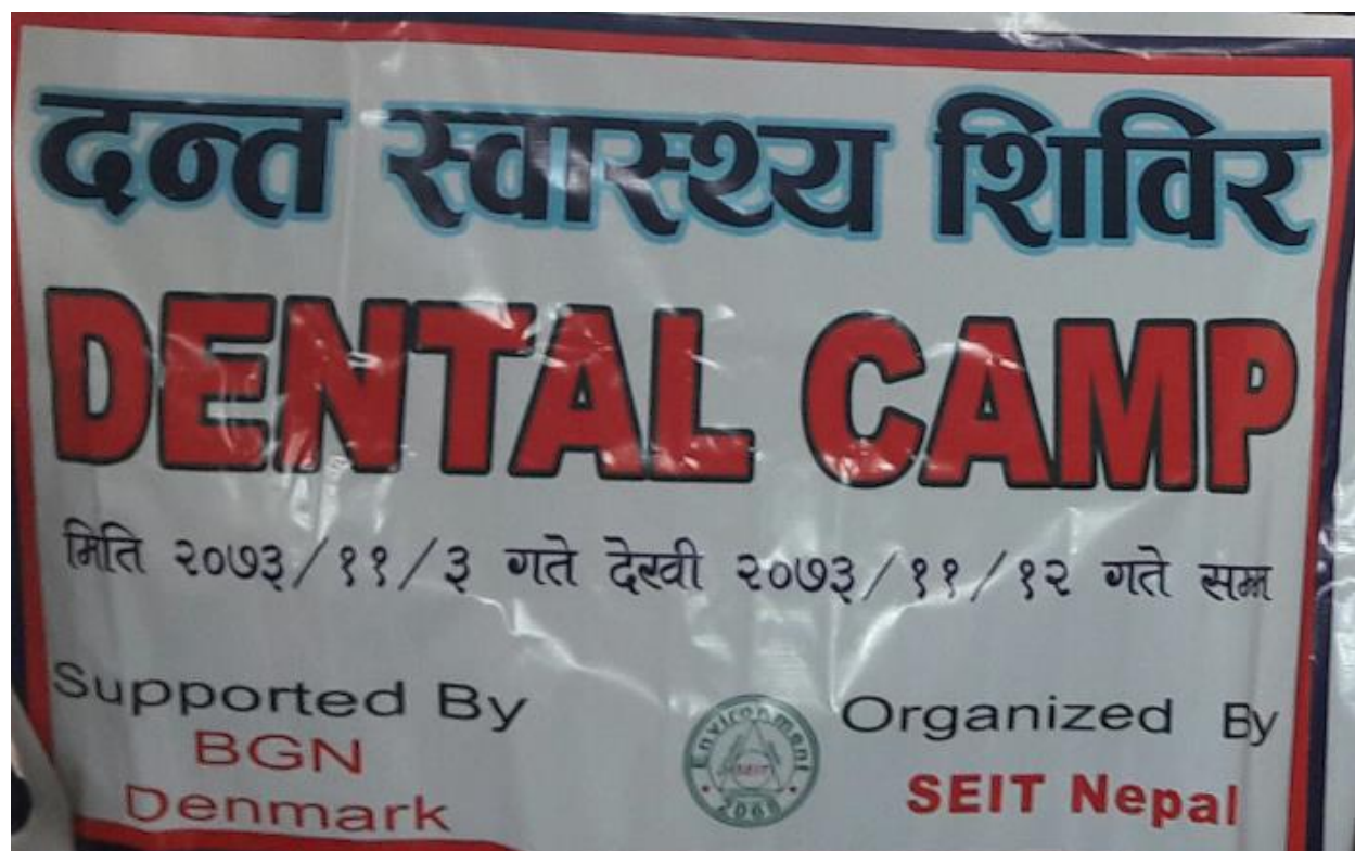
Banner of Dental Camp