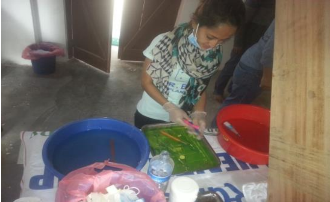
Sterilization of the equipment