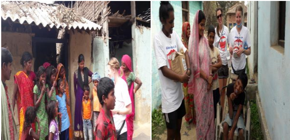
Awareness Program on street

The above dental check-up and awareness camp is one of the many free social events organized by the SEIT Nepal throughout the year.