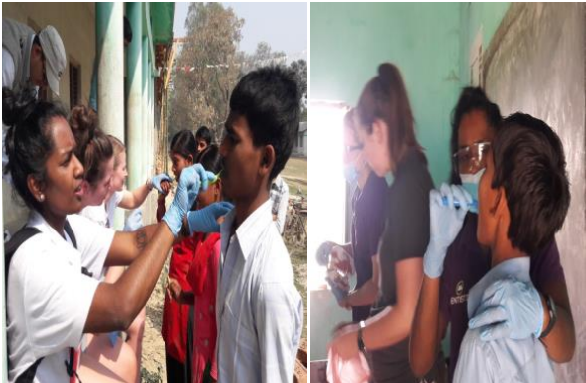
Dental Hygienists brushing the school children teeth