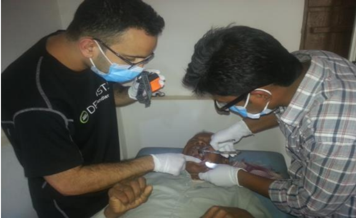
Tooth eruption done by doctor

Patients were also given dental health related information like danger of smoking, Tobacco chewing and betel chewing and instruction on tooth brushing and maintaining their oral health. Various medicines and dental health pack were provided.