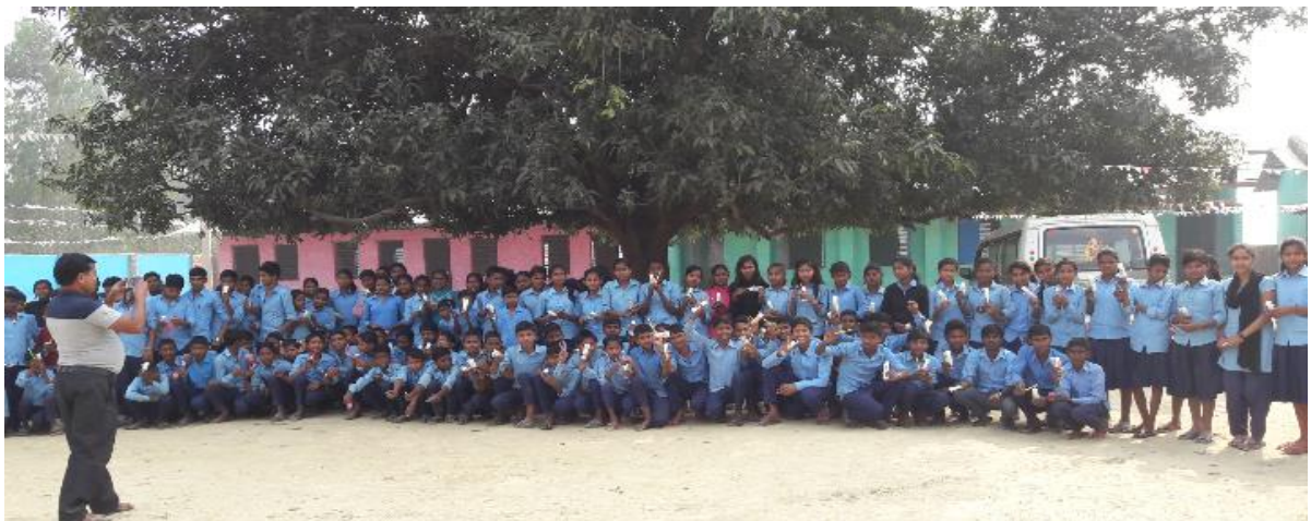
Distribution of junior tooth paste and junior tooth brush to every children

In second session, the children are motivated to take care of dental health by providing dental pack consisting of junior toothpaste and a junior brush to every children.