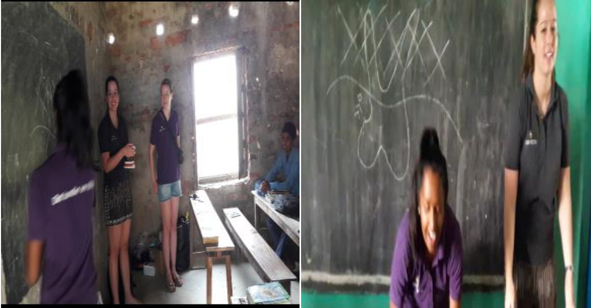
Explaining about tooth structure, bacterial plaque and what damage can it do?

The dental hygienists attended the small children classes with a soft music and dance to gain their attention which is one of the most effective methods for teaching a lesson in entertaining way as well as gaining student attention.