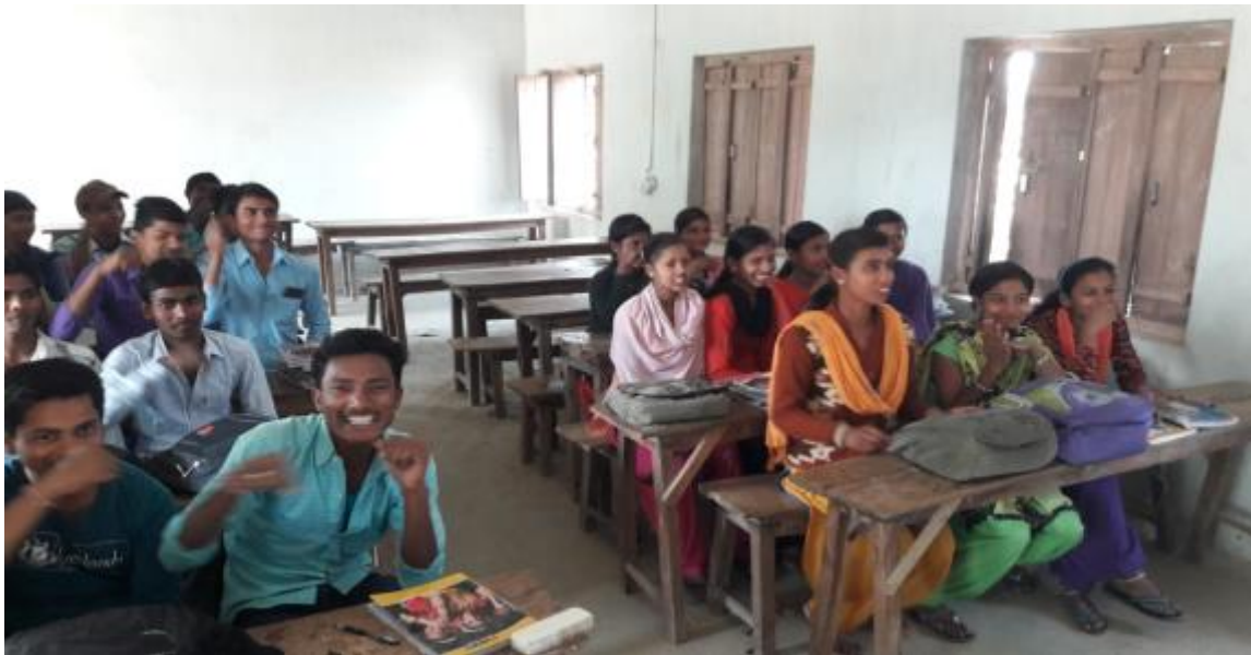
Screening dental hygiene and knowledge regarding brushing method among school children

First of all, simply screening program is conducted with the help of school teacher to test the knowledge level about dental health and brushing method among school children.