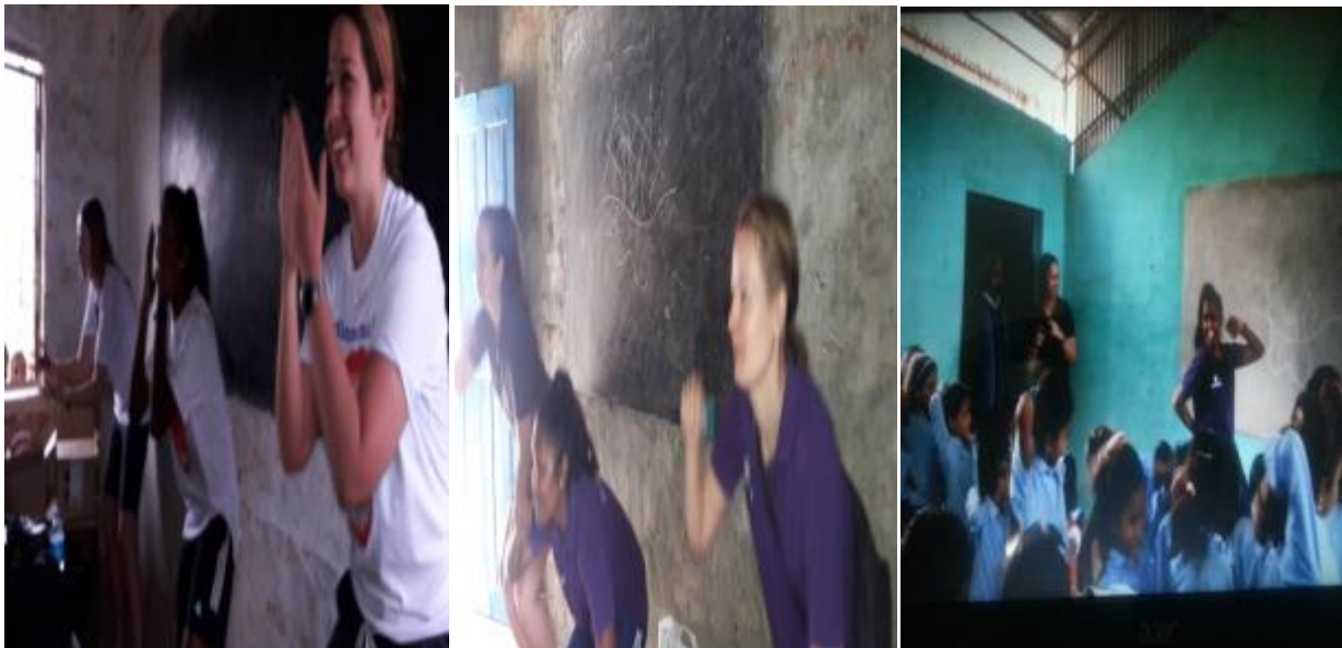
Dental Hygienists teaching a lesson by dancing method

The dental hygienists attended the small children classes with a soft music and dance to gain their attention which is one of the most effective methods for teaching a lesson in entertaining way as well as gaining student attention.